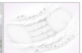
Show on Diaper